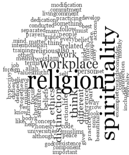
Figure3: Word cloud for Workplace spirituality and Religion

Few faculty members were unaware of the concept of spirituality in the workplace and did not comment on the concept. As one respondent said, “I cannot comment a lot on it, but to me religion is a belief system and defined actions of individuals”. Another replied, “I haven’t studied it so I can’t comment on it, but religion is a complete code of life, we cannot separate it from any action”. One more opined that “They might be linked or not; no idea at all”.