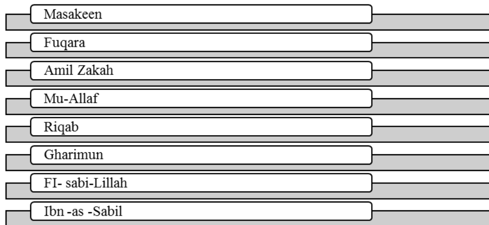
Figure 1: Criteria for receiving Zakat 7

Eight groups of citizens are entitled to obtain Zakat. This categorization has been mentioned in the holy Quran.