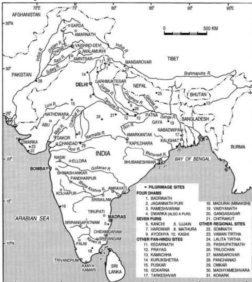
Figure 3 Sacred Sites in South Asia

Danapunaya , Svarga (morality and heaven), Evils of papa/karma (immoral acts/pleasure seeking), Nekkhamma (value of renunciation) are the gradual levels that enable the merger of one's self with Buddha.