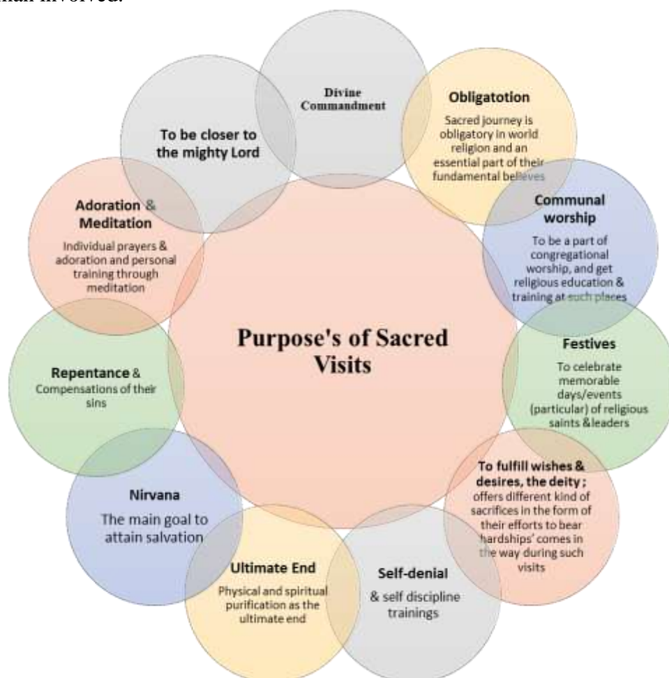
Figure 4: Purpose's of Sacred Visits

regarding the sacred sites. To establish these sites, deep mystery & wisdom of human involved.